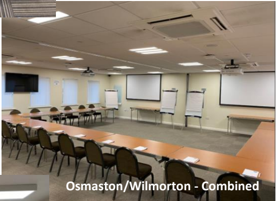
Osmaston/Wilmorton - Combined